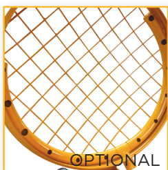
Dust Control Item no. 300 001DL