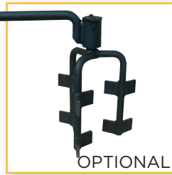
TURBO mixer arm wo/rubber blades Item no. 300 025