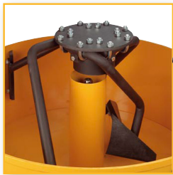
Mixer arms, complete set incl. rubber blades, top disc, U-bolts Item no. 300 024