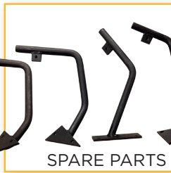
Mixer arms wo/top disc, wo/rubber blades Item no. 300 024B