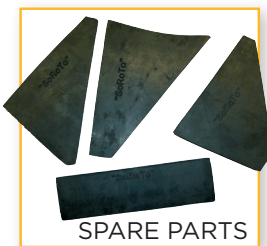
Mixer blades, rubber, Item no. 300 024R

Item no. 300 000 (with rubber blades as standard)