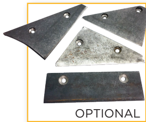
Mixer blades, Hardox-steel Item no. 300 024S